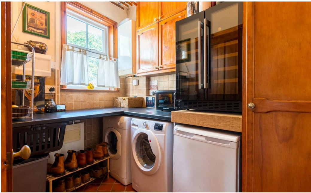
KITCHEN 15'6" x 9'0"