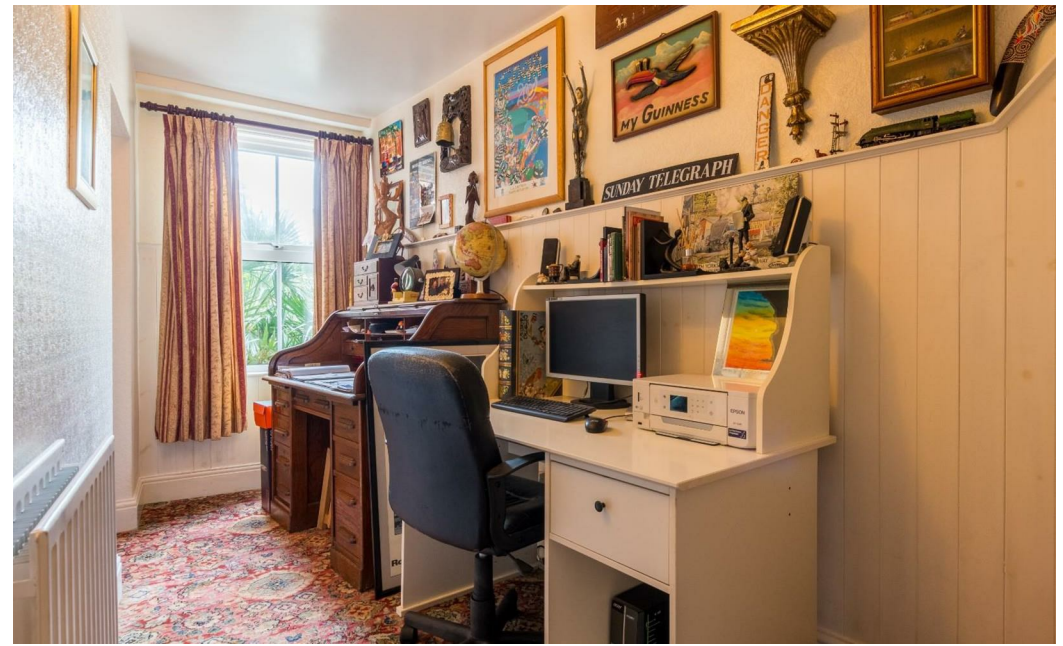
CELLAR 18'0" x 9'6"